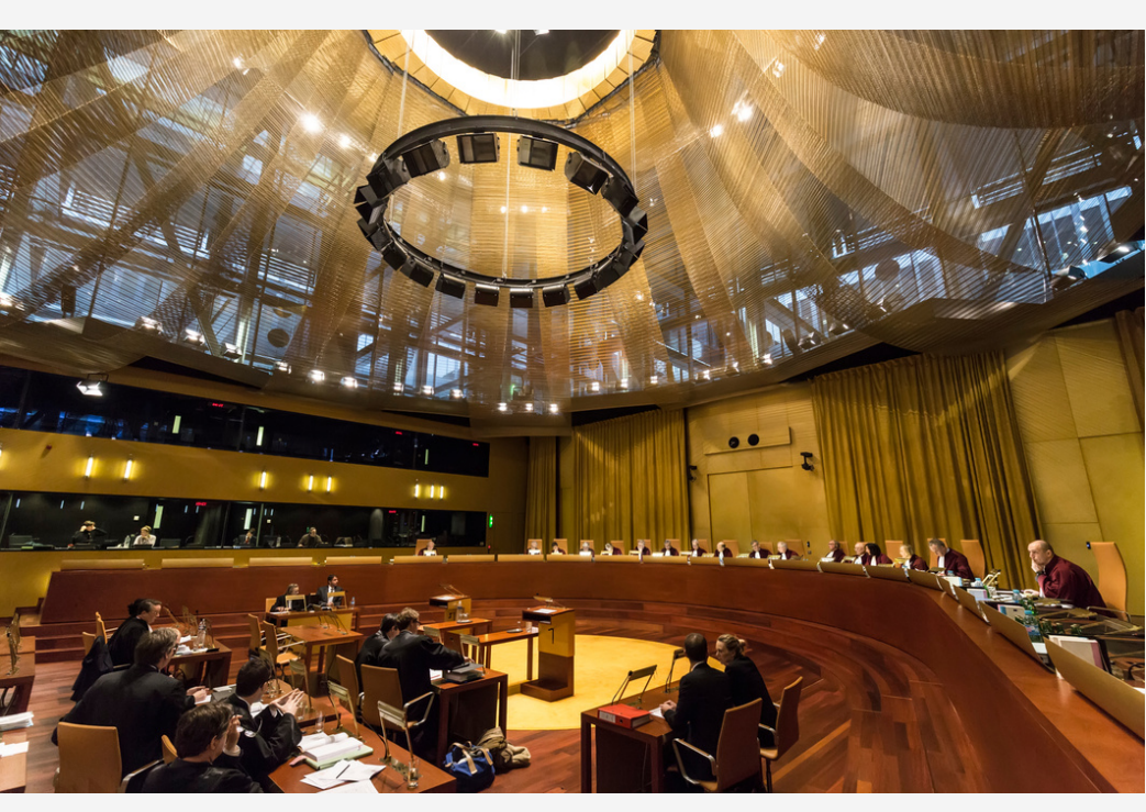
'Court of Justice of the European Union'