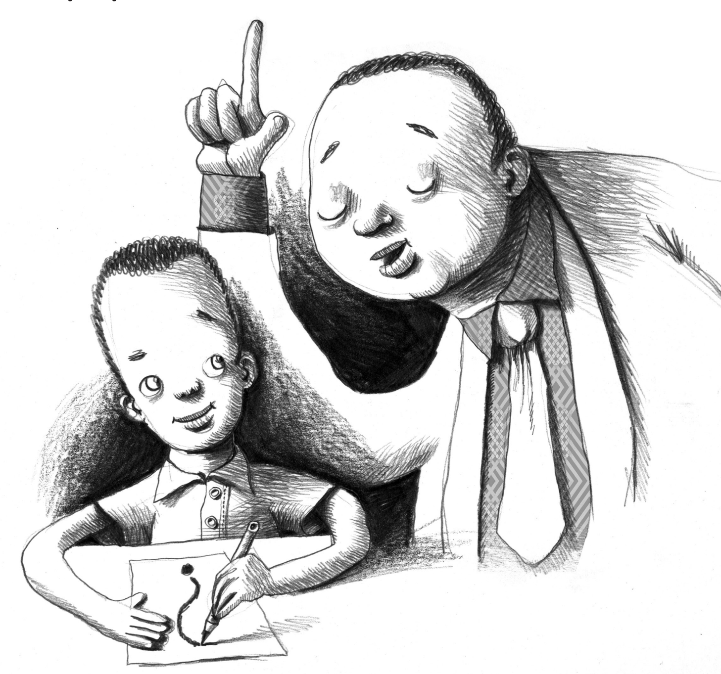
Please check up that I have really understood.

I may need an extra explanation from the teacher or another pupil to be able to understand.